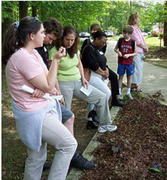
SR2S Course participants observe and document the drop-off area as school let out at Estes Hills Elementary School in Chapel Hill, NC. Participants then brainstormed and presented recommended improvements to the school's principal.

With funding from the Federal Highway Administration, the National Highway Traffic Safety Administration, the Centers for Disease Control and Prevention and the Environmental Protection Agency, the PBIC developed the course with a clear intent to address relevant health, transportation and safety issues for community stakeholders – from city planners to parents – interested in improving walking and bicycling conditions for children.